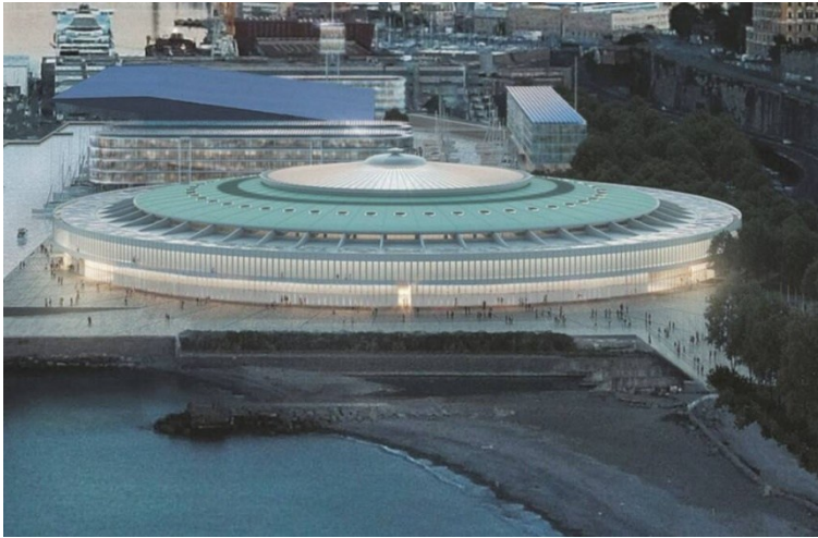
Hall of finals

Address: P.le John Fitzgerald Kennedy, 1 16128 Genova GE Italy