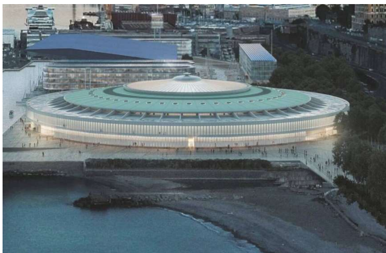
Hall of finals

Address: P.le John Fitzgerald Kennedy, 1 16128 Genova GE Italy