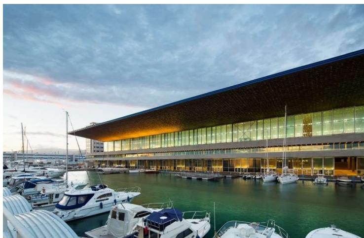
Hall of preliminaries

Address: P.le John Fitzgerald Kennedy, 1 16128 Genova GE Italy